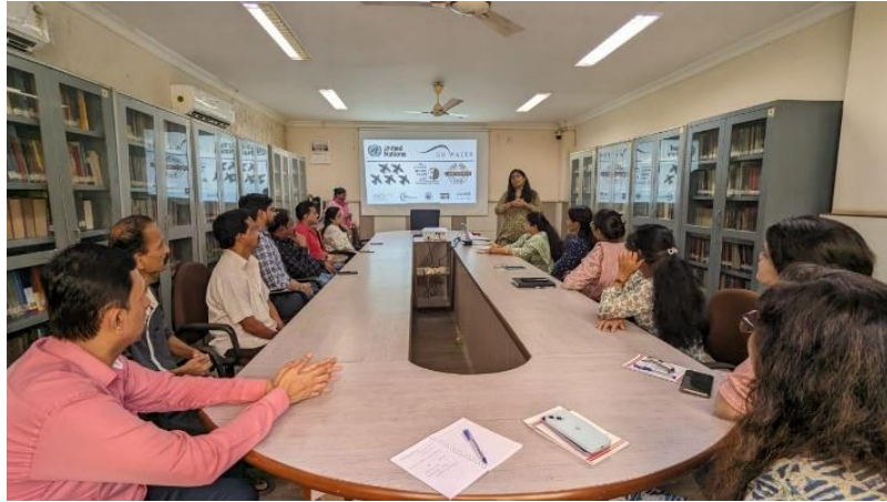
Introducing World Toilet Day through the story of Hummingbird story