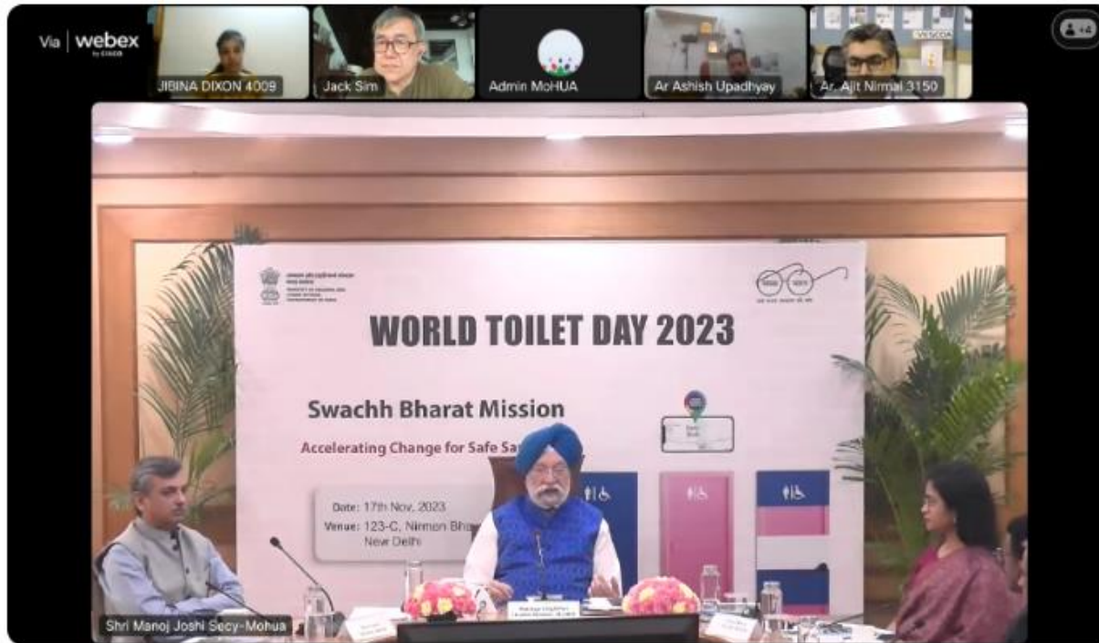
World Toilet Day 2023 Swachh Bharat Mission - Accelerating Change for Safe Sanitation