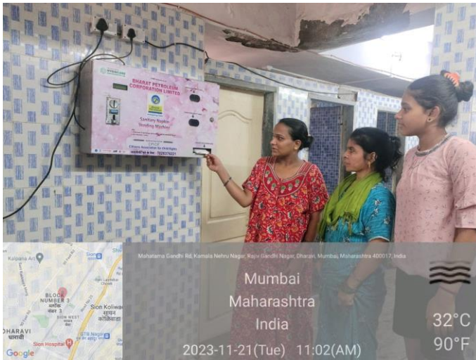
Women Using Sanitary Napkin wending machine.