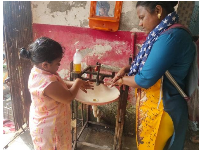
CACR volunteer reminding the young cub the steps to wash hands.

Citizens Association for Child Rights (CACR) celebrated World Toilet Day with 50 children and 80 women by conducting activities at Bhoomi Swachhta Foundation and Telugu Youth Foundation (Toilets) at Dharavi.