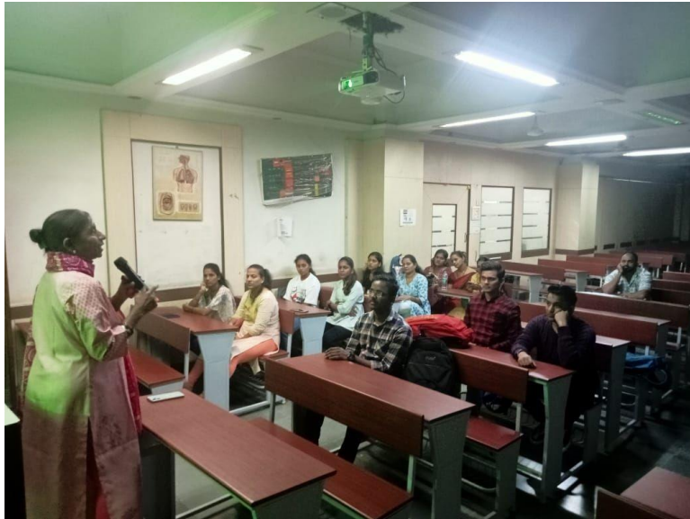
Trainers from RCUES Mumbai spread awareness on World Toilet Day with the Students of Sanitary Inspector Diploma Course at AILSG Mumbai