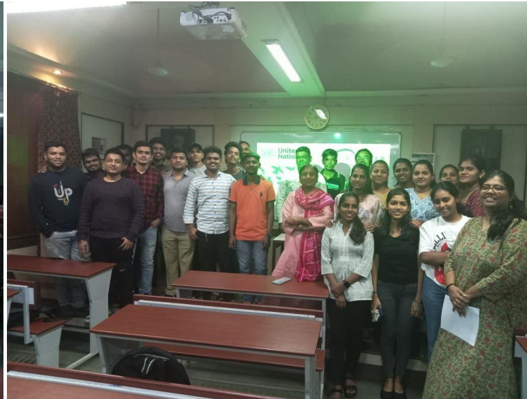
The Young Warriors of Sanitation!

On 21 st November 2023, 25 students of the Sanitary Inspector Diploma Course of AILSG Mumbai were given special training on World Toilet Day. Keeping in mind their youthful nature and tweaking the training according to their course syllabus, it aimed to spread awareness on Sustainable Development Goals, significance of World Toilet Day and the importance of their contribution as Sanitary Inspectors.