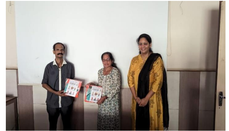
Felicitation of our champions, our #SafaiMitras! Sanitation Workers of AIIISG, Mumbai