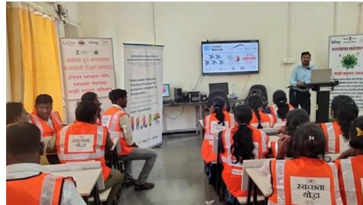
Sanitation Workers undergoing training on World Toilet Day at Malegaon.