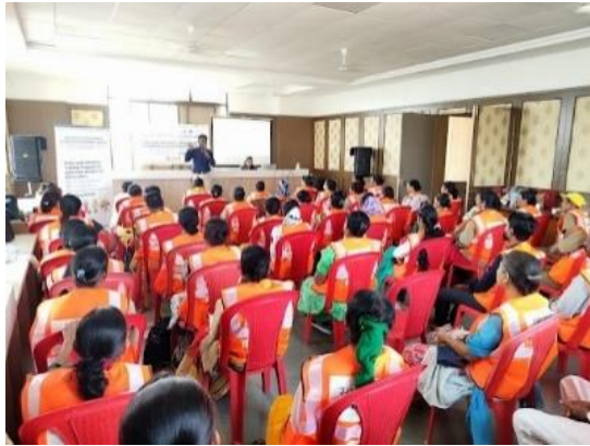
Sanitation Workers during the special training on World Toilet Day at Talegaon.