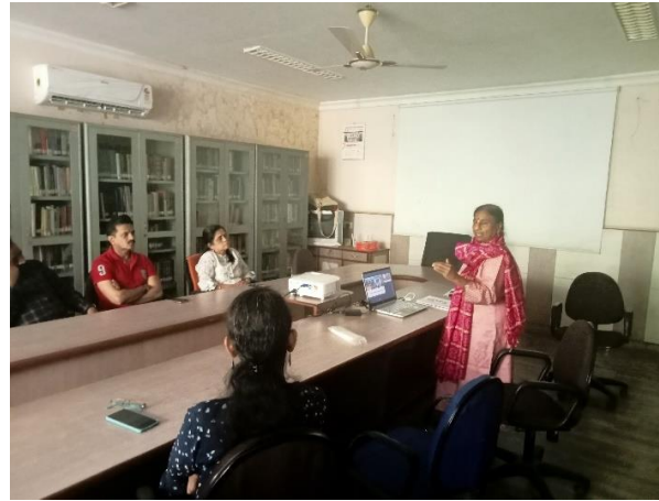
We are Together in This! Training of Sanitation Workers along with Office staff